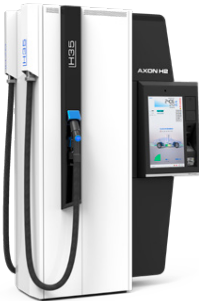
» AXON H2